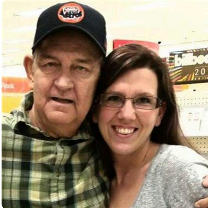
Last picture of my daddy and I. I know him and my mother are watching over me and their grandbabies!